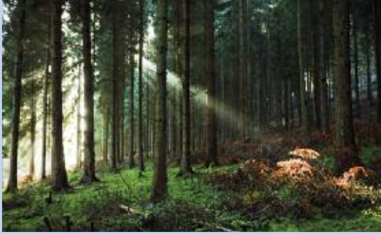
David J Slater (rspb-images.com)

DECC research shows that wood from the trunks of conifers such as these are best used in construction and furniture rather than for energy production.